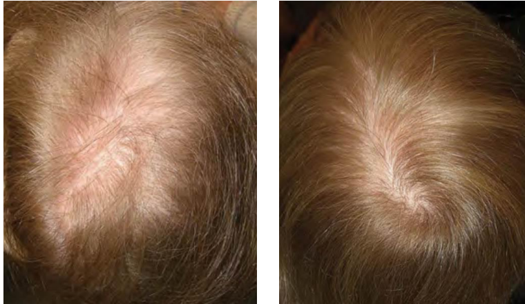
Before and after usage of Mayraki Professionals Hair Regrowth Ulti-Nutra Laser System

After conducting clinical studies on participants, who experienced alopecia, promising results were observed across all groups of participants, which was visibly confirmed through trichoscopy. During the trial, several participants experienced an outstanding 94% increase in hair growth.